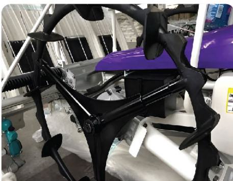
Large-diameter wheels: The large-diameter wheels improves the adaptability to field operation and field passability