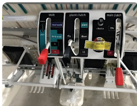
Centralized operating panel for the handle is located directly in front of the operator, making it easier to operate